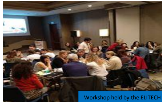
Workshop held by the ELITECH GROUP at the MECFC 2019