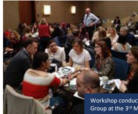
Workshop conducted by Elitech Group at the 3 rd MECFC 2019, Istanbul.

Exhibitor assumes entire responsibility and hereby agrees to protect, indemnify, defend and hold harmless MECFA, the HORMUZ GRAND, MUSCAT-A RADISSON COLLECTION HOTEL, Oman, their directors, officers, employees, agents, parents and subsidiaries against all actions, claims, losses, and damages to persons or property. Notwithstanding the foregoing, MECFA, its directors, officers, agents, and employees, separately or collectively or the HORMUZ GRAND, MUSCAT-A RADISSON COLLECTION HOTEL, Oman its directors, officers, agents, and employees, separately or collectively, will accept responsibility for any damage to, or the loss or destruction of, an exhibit or the property of an exhibitor, his agents or employees, or the death or injury of any person employed by the exhibitor or for whom the exhibitor is responsible or over whom the exhibitor has control from fire, theft, or accidents or other causes of any kind. All claims for any such loss, exhibitor expressly waives damage, destruction, death, or injury.