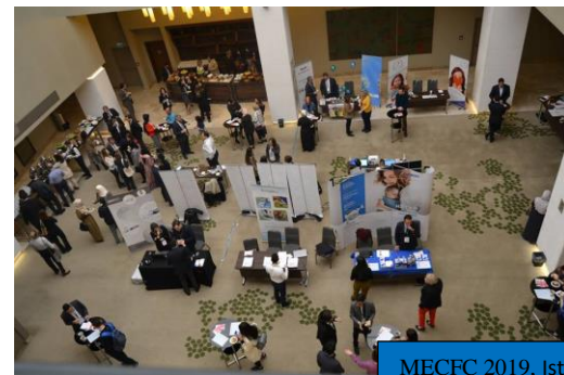
MECFC 2019, Istanbul Turkey

All electrical, plumbing, telephone services, internet services, telecommunications, and AV equipment needs must be requested through the specified contractor for each type of service. Please email mecfc@primeqm.com and describe your utility and AV needs so appropriate services may be provided at your booth.