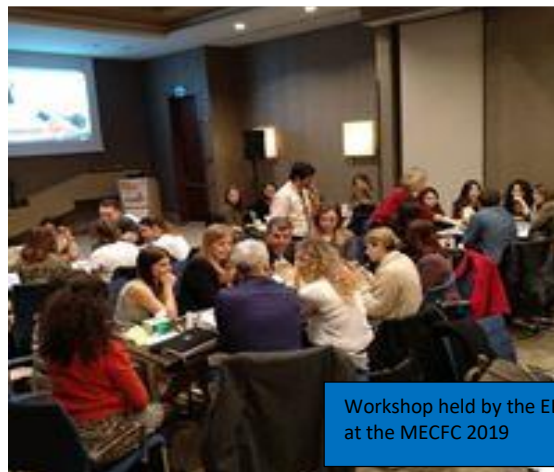
Workshop held by the ELITECH GROUP at the MECFC 2019