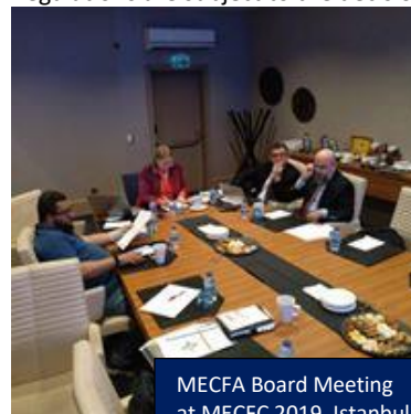
MECFA Board Meeting at MECFC 2019, Istanbul

All matters and questions not specifically stated in these Rules and Regulations are subject to the decision of the MECFC Management.