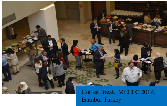
Coffee Break, MECFC 2019, Istanbul Turkey

Distribution of samples is not specifically prohibited, but may not be appropriate. Promotional items that will be distributed within exhibit booths must be pre-approved. Exhibitors wishing to distribute items other than product samples or educational material(s) must submit a request in writing, along with a product description to MECFC Management, by Nov 1, 2019.