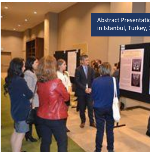
Abstract Presentation at the 3 rd MECFC held in Istanbul, Turkey, 2019

* Services and activities will be provided by MECFC. Production of signage, napkins & beverage cups and any other printed material with company logo will be the responsibility of the sponsor to produce & provide.